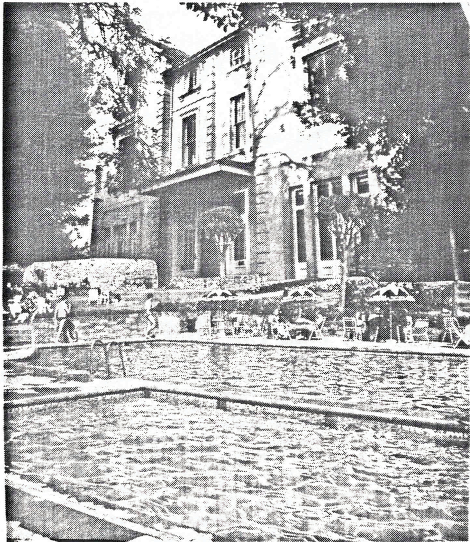
A TYPICAL VIEW OF THE MAIN ACCOMODATION AREA

THE STAY OF A LIFETIME FOR EVERY STUDENT!!